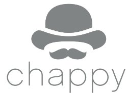
FINAL LOGO / SOCIAL MEDIA