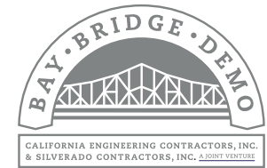
FINAL LOGO / PUBLIC WORKS